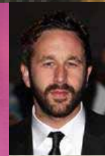
Chris O'Dowd, International Award Winning Actor

“ On St Stephens Day, when hot toddies are served up during the treasure hunt at Lough Key, this remains my favourite time of the year.”