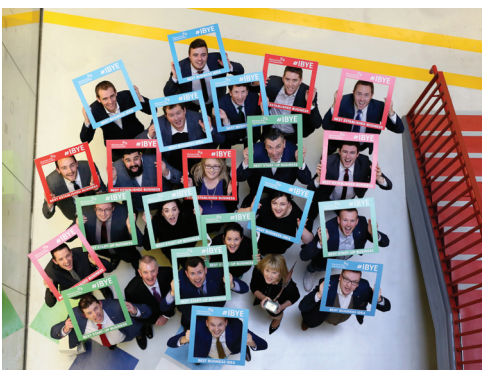
IBYE (Ireland's Best Young Entrepreneur) is a €2m investment competition organised by the LEOs every year, supported by the Department of Business, Enterprise and Innovation, Enterprise Ireland, Google and local authorities. The 2019 IBYE National Final takes place on 15 September, involving 24 finalists from across the country aged between 18 and 35.