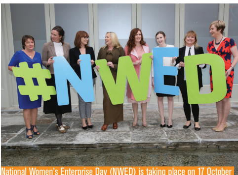
National Women's Enterprise Day (NWED) is taking place on 17 October and the 2019 theme is 'Making It Happen'. This will be the 13th annual NWED with events being organised by every LEO around the country.