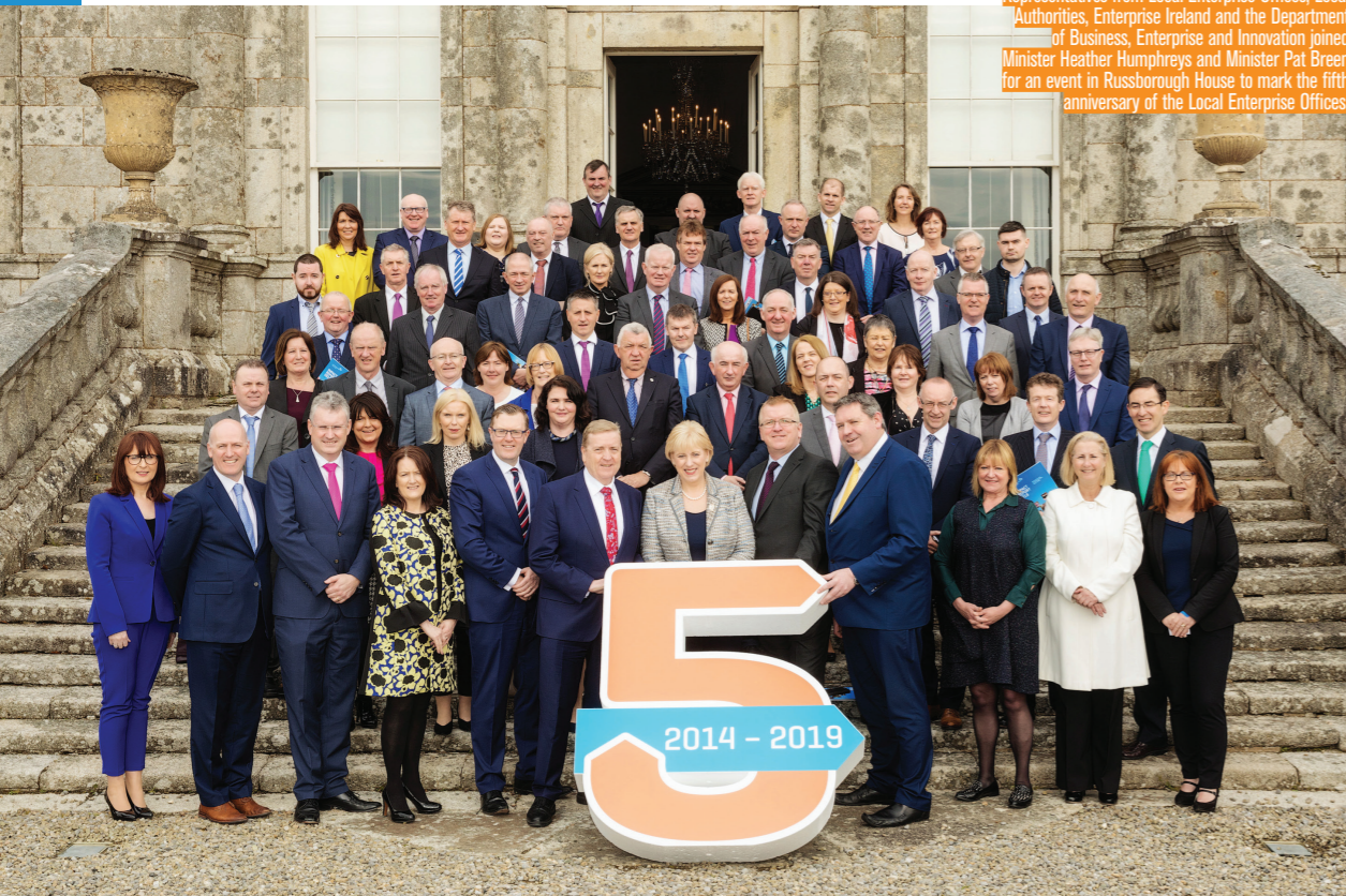
Representatives from Local Enterprise Offices, Local Authorities, Enterprise Ireland and the Department of Business, Enterprise and Innovation joined Minister Heather Humphreys and Minister Pat Breen for an event in Russborough House to mark the fifth anniversary of the Local Enterprise Offices.