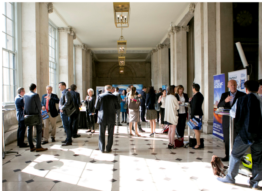
Photo 10: Infrastructure Summit mingle at a Reception in Dublin City Hall